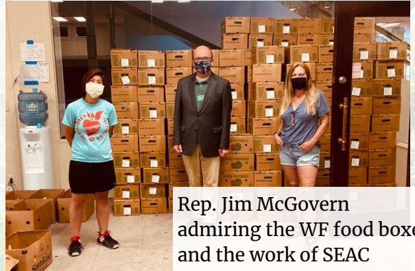
Rep. Jim McGovern admiring the WF food boxes and the work of SEAC

Coordinated with 14 non-profit partners to purchase and/or distribute Flats Mentor Farm produce to feed hungry people during the pandemic. We were so grateful to partner with the Springfield Food Policy Council, Southeast Asian Coalition, Growing Places, Pocasset Pokanoket Land Trust, and many others.